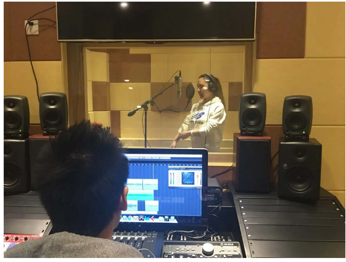
Fig.1 Teaching in Recording Arts

Recording arts major is developed for film, television, broadcasting and other industries to cultivate high-quality senior technical talents with both ability and political integrity who can engage in recording work, and for film, television and other artistic creation units to train sound artists who can engage in sound artistic creation of film and television works. In the modern world, professional education in recording arts is regarded as a part of film and television education, and the recording course is a basic required course for film and television majors. Only in the future practical work or later study will there be more professional sound engineers, sound mixer and so on<sup>[9]</sup>. At present, although all colleges and universities have the curriculum standards designated by the national education department, in actual teaching activities, many colleges and universities will adjust the curriculum standards according to the actual situation of their own schools, but the results after adjustment are often difficult to achieve the ideal purpose. Teaching in recording arts is shown in Figure 1.